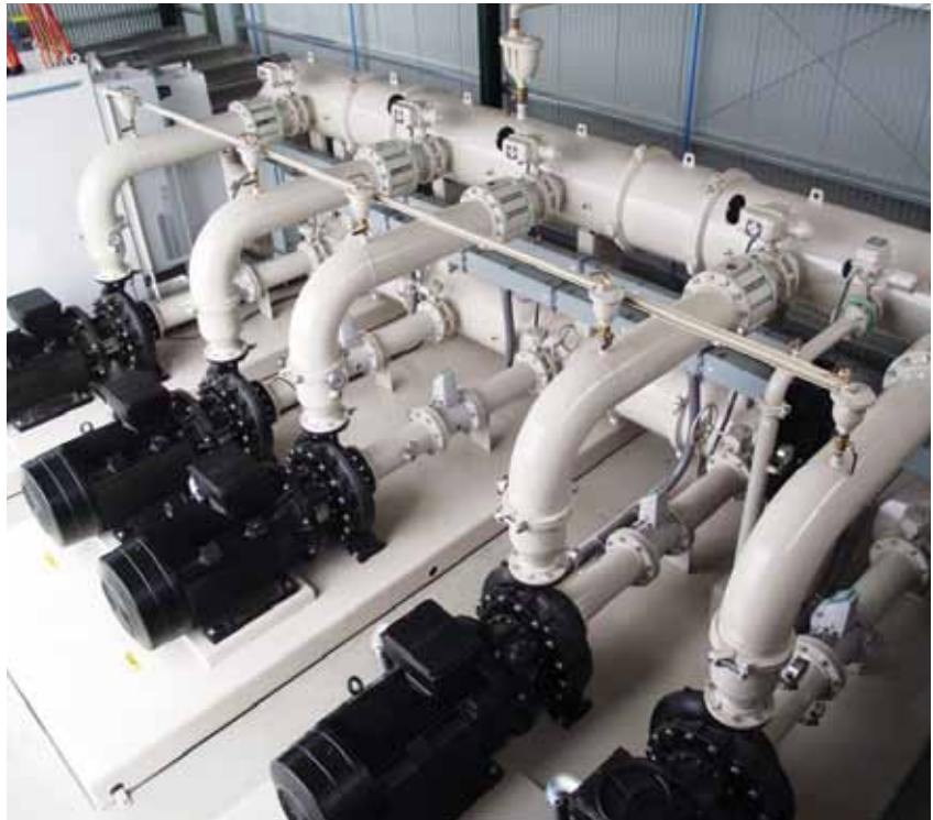
To conserve land and water resources, a Watertronics pump station (above) and 13 new Zimmatic center pivots were installed to irrigate local crops with the town's treated wastewater.

In addition, the project required accurate recording of the volume of wastewater applied through the pivots, high rainfall shutdown capabilities and "burst pipe" alarms.