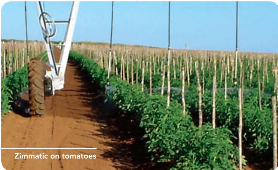
Zimmatic on tomatoes