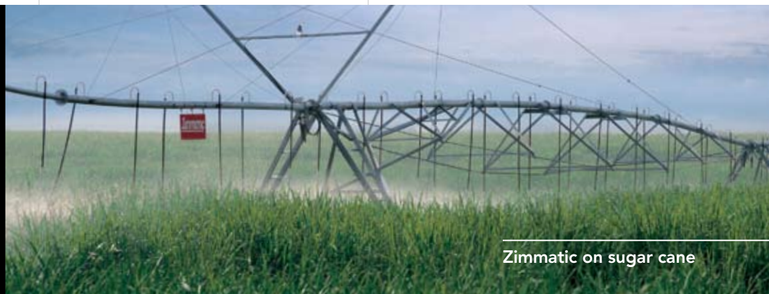
Zimmatic on sugar cane

CENTER PIVOT IRRIGATION SYSTEMS INCREASE MOST CROP YIELDS BY AT LEAST 20%