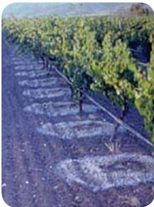
Drip irrigation creates salt buildup at irrigated/non-irrigated zone boundary.